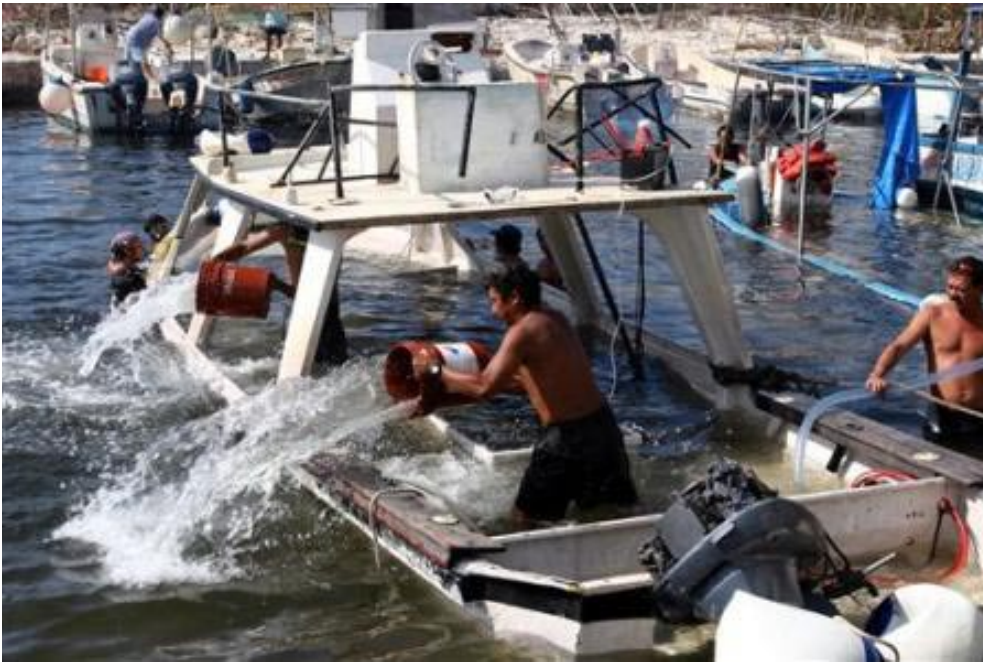
Men attempt to bail out a partially submerged boat in Cozumel, Mexico, Oct. 24, 2005 in the aftermath of Hurricane Wilma.