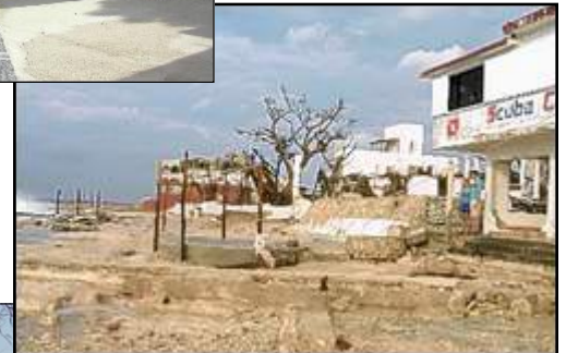
Scuba Club Cozumel